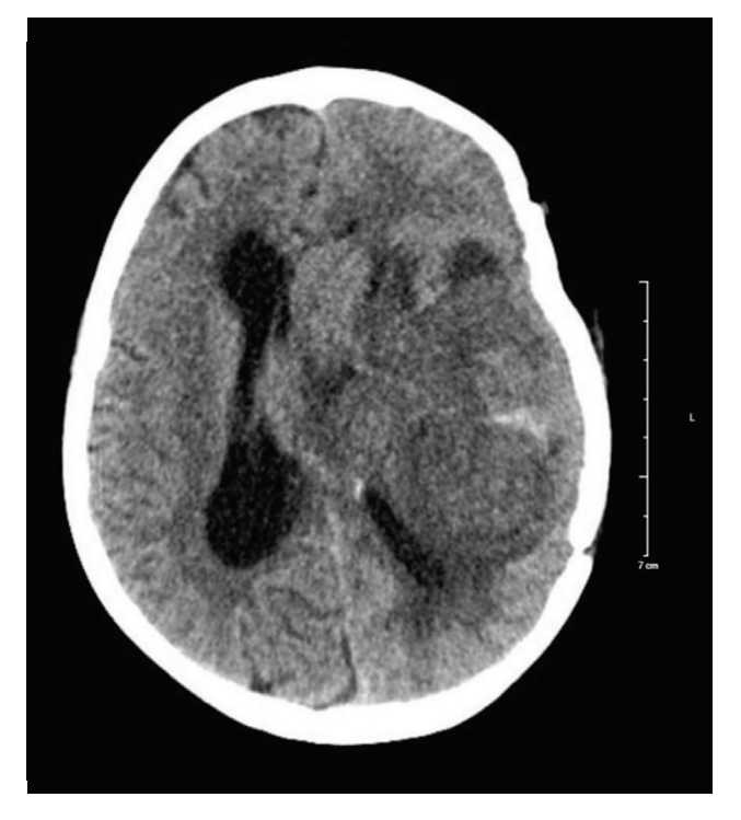
Figure 2. Plain and contrast CT scan showed a post craniotomy defect in the left fronto-parietal bones where in excision of the previous mass was noted. There is shift in the midline structures to the right with a finding of ill-defined non enhancing mass in the left fronto-parietal lobes measuring 7.0 x 6.5 x 8.0 cm replacing the malacic focus in the left parietal lobe. This lesion compresses the left lateral and third ventricles. There is effacement of the brain parenchyma in the left cerebral hemisphere and minimal perilesional edema above the lesion.

The case was subsequently referred to a pediatric tertiary hospital. Immunohistochemistry performed at the said institution showed that the neoplastic cells are positive for CD99 and has diffuse nuclear positivity for myoblast determination protein 1 (MyoD1). Immunohistochemical staining for desmin, myogenin, CD34, S100 and SRY-Box transcription factor (SOX) 10 are all negative. Fluorescent in situ hybridization (FISH) targeting FOXO1 gene is negative. Reverse transcription polymerase chain reaction (RT-PCR) is positive for fusion transcript consistent